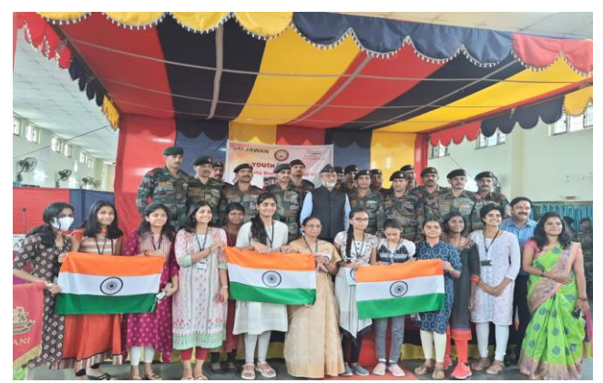
They were introduced to the Chief Guest who gave them an overview of his accomplishments throughout his career

as well as a brief indication of what the army stands for. It was incredibly enlightening and inspiring. The main ritual, which involved tying Rakhis to our fellow brothers in uniform, the soldiers, came next. Every girl was overjoyed to be doing this, and their joy could be seen all over their faces. They received the Indian flag in exchange, and nothing makes Indians more proud than to fly the national flag since it symbolizes our spirit and freedom. The students had the opportunity to speak with each soldier individually while enjoying refreshments. They spoke about their personal experiences and sought guidance on how to register in the army.