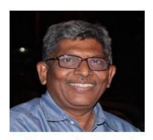
Dr. C. Umamaheswara Rao IAS (Retd.)

This month has been packed with great events to fill the youth with patriotic spirit. On the occasion of the 75th Independence day, the whole country celebrated it in a very grand manner. The tricolor festival has now set a benchmark in the way of celebrating festivals. As an organization, Samskruti Foundation wishes to inculcate patriotic spirit, not only through National Festivals but also through our age-old festivals like Raksha Bandhan.